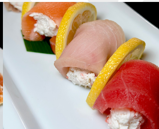
TORI BLOSSOM 8.45 IN: I-CRAB OUT: TUNA, ALBACORE, SALMON, YELLOWTAIL, SPICY EEL SAUCE