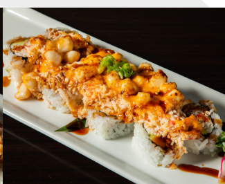
BAKED SCALLOP 6.95 IN: I-CRAB, AVOCADO OUT: I-CRAB SCALLOP MIX, GREEN ONION, BAKE MAYO, EEL SAUCE