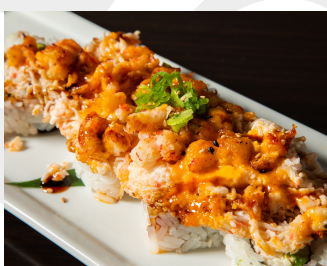
BAKED LOBSTER 6.95 IN: I-CRAB, AVOCADO OUT: I-CRAB CRAWFISH MIX, GREEN ONION, BAKE MAYO, EEL SAUCE