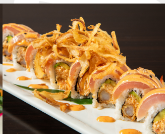
ALBACORE TRAIN 7.95 IN: SPICY I-CRAB, AVOCADO SHRIMP TEMPURA OUT: ALBACORE, FRIED ONION, GARLIC PONZU, SPICY MAYO