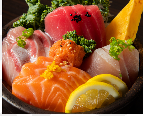
TORI CHIRASHI 40 1PCS UNI, 3PCS TUNA, 3PC SALMON, 3PCS YELLOWTAIL, 3PCS ALBACORE, SPICY TUNA, SALMON ROE, TAMAGO