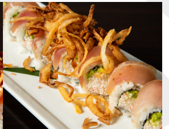
FLY TO THE ALBA 6.95 IN: I-CRAB, AVOCADO OUT: ALBACORE, FRIED ONION, JAPANESE DRESSING