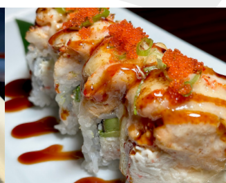
HOT MONSTER 7.45 IN: I-CRAB, AVOCADO OUT: SPICY ALBACORE, CRAWFISH, GREEN ONION, MASAGO, BAKE MAYO, EEL SAUCE