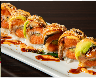
LAS VEGAS 7.45 IN: SPICY TUNA, CUCUMBER OUT: SPICY TUNA, EEL, AVOCADO, CRUNCH FLAKES, SPICY MAYO, EEL SAUCE