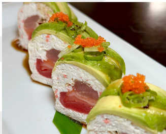
PROTEIN 8.45 IN: I-CRAB, TUNA, SALMON, ALBACORE IN SOY PAPER OUT: AVOCADO, MASAGO, GREEN ONION, JAPANESE DRESSING