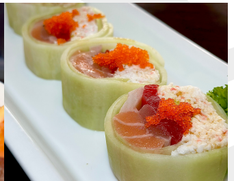
CUCUMBER SPECIAL 8.45 IN: I-CRAB, AVOCADO, TUNA, SALMON, ALBACORE, YELLOWTAIL OUT: CUCUMBER, PONZU, MAYO, EEL SAUCE