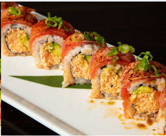
SEXY HAWAIIAN 6.95 IN: SPICY I-CRAB, AVOCADO OUT: CAJUN TUNA, GREEN ONION, GARLIC PONZU