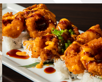
CALAMARI ROLL 7.45 IN: I-CRAB, AVOCADO OUT: CALAMARI TEMPURA, SPICY MAYO, EEL SAUCE