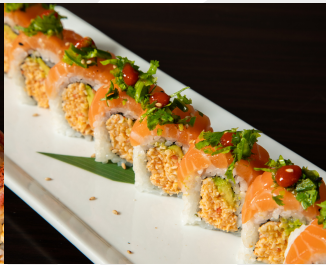
SALMON SURPRISE 6.95 IN: SPICY I-CRAB, AVOCADO OUT: SALMON, PONZU, CILANTRO JALAPEÑO MIX, SRIRACHA