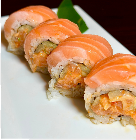
SUMMER 7.95 IN: SPICY SALMON, CUCUMBER OUT: SALMON, PONZU