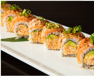
ALASKAN 6.95 IN: SPICY I-CRAB, AVOCADO OUT: PEPPER SALMON, GREEN ONION, GARLIC PONZU