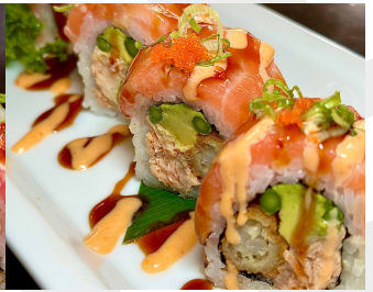
PINK ARROW 7.95 IN: BAKED SALMON, AVOCADO, ASPARAGUS, SHRIMP TEMPURA OUT: SALMON, GREEN ONION, MASAGO, PONZU, EEL SAUCE, SPICY MAYO