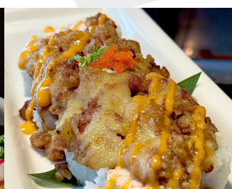
I LOVE SALTY 6.95 IN: I-CRAB, AVOCADO OUT: JAPANESE STYLE MARINADE SPAM, BAKE MAYO