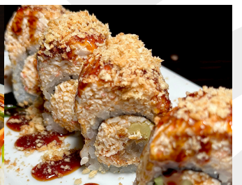
JOHNNIE X 7.45 IN: SPICY I-CRAB, AVOCADO SHRIMP TEMPURA OUT: SPICY I-CRAB, EEL SAUCE