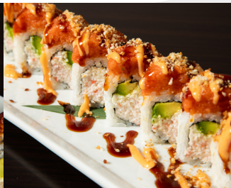
FIRE DRAGON 6.95 IN: I-CRAB, AVOCADO OUT: SPICY TUNA, CRUNCH, EEL SAUCE, SPICY MAYO