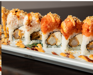
JEKYLL AND HYDE 7.45 IN: CREAM CHEESE, SHRIMP TEMPURA OUT: I-CRAB, SPICY TUNA, CRUNCH FLAKES, SPICY MAYO, EEL SAUCE