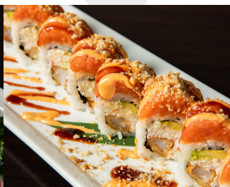
HOT NIGHT 7.45 IN: I-CRAB, SHRIMP TEMPURA, AVOCADO OUT: SPICY TUNA, CRUNCH FLAKES SAUCE: SPICY MAYO, EEL SAUCE