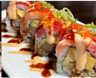
BLACK MANGO 7.95 IN: MANGO, AVOCADO, EEL, SHRIMP TEMPURA OUT: TUNA, SALMON, GREEN ONION, MASAGO, SPICY MAYO, EEL SAUCE