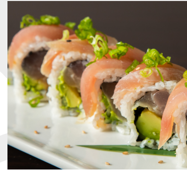
ALBACORE LOVER 7.95 IN: ALBACORE, CUCUMBER, AVOCADO OUT: ALBACORE, GREEN ONION, GARLIC PONZU