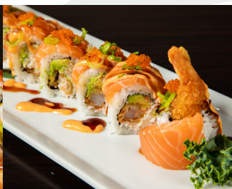
SALMON TRAIN 7.45 IN: I-CRAB, SHRIMP TEMPURA, AVOCADO OUT: SALMON, GREEN ONION, MASAGO, PONZU, SPICY MAYO, EEL SAUCE