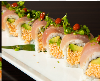
ALBACORE SURPRISE 6.95 IN: SPICY I-CRAB, AVOCADO OUT: ALBACORE, GARLIC PONZU, CILANTRO JALAPEÑO MIX, SRIRACHA