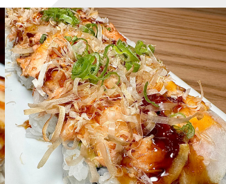
ROCK N ROLL 7.45 IN: I-CRAB, AVOCADO OUT: CRAW FISH, SCALLOP, BAKED SALMON, ONION, BONITO FLAKES, BAKE MAYO, EEL SAUCE