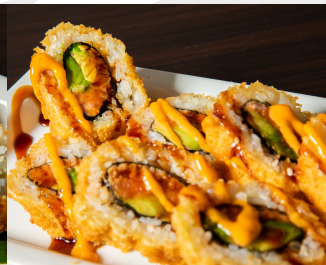
GOLDEN SPICY TUNA 5.95 IN: SPICY TUNA, AVOCADO OUT: EEL SAUCE, SPICY MAYO