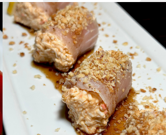
XXX 8.45 IN: SPICY I-CRAB, CRUNCH FLAKES OUT: ALBACORE, JAPANESE DRESSING, CRUNCH FLAKES