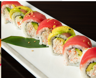
HAWAIIAN 6.95 IN: I-CRAB, AVOCADO OUT: TUNA, AVOCADO, PONZU