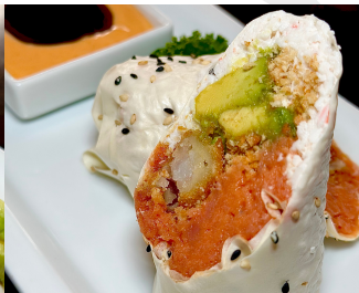
TORI BURRITO(2PCS) 8.45 IN: I-CRAB, SPICY TUNA, AVOCADO, CRUNCH FLAKES, SHRIMP TEMPURA, SPICY MAYO, EEL SAUCE IN SOY PAPER