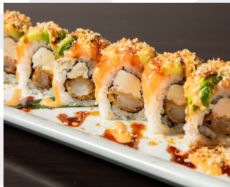
SEXY BOMB 7.45 IN: CREAM CHEESE, SHRIMP TEMPURA OUT: SALMON, AVOCADO, CRUNCH FLAKES, PONZU, SPICY MAYO, EEL SAUCE