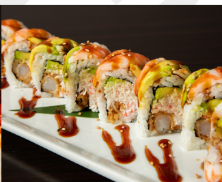
SHRIMP LOVER 7.45 IN: I-CRAB, SHRIMP TEMPURA, AVOCADO OUT: SHRIMP, AVOCADO, PONZU, SPICY MAYO, EEL SAUCE