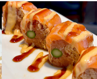
PINK LADY 8.45 IN: SPICY TUNA, ASPARAGUS, BAKED SALMON IN SOY PAPER OUT: SALMON, PONZU, SPICY MASAGO MAYO, EEL SAUCE