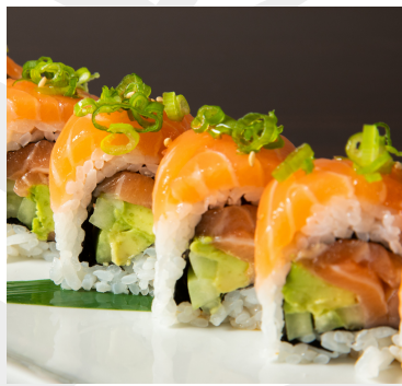
SALMON LOVER 7.95 IN: SALMON, CUCUMBER, AVOCADO OUT: SALMON, GREEN ONION, PONZU