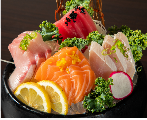
TORI SASHIMI 39 1PCS UNI, 3PCS TUNA, 3PC SALMON, 3PCS YELLOWTAIL, 3PCS ALBACORE