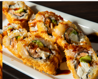
GOLDEN PHILADELPHIA 6.95 IN: SALMON, AVOCADO, CREAM CHEESE OUT: EEL SAUCE