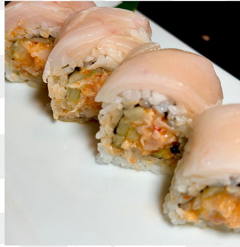
WINTER 7.95 IN: SPICY YELLOWTAIL, CUCUMBER OUT: YELLOW TAIL, PONZU