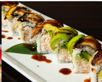
DRAGON 6.95 IN: I-CRAB, AVOCADO OUT: EEL, AVOCADO, EEL SAUCE