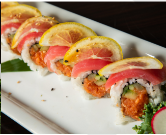
TULIP 6.95 IN: SPICY TUNA, CUCUMBER OUT: TUNA, LEMON SLICES, PONZU