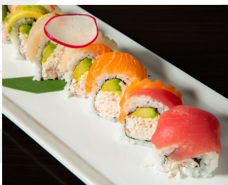
RAINBOW 6.95 IN: I-CRAB, AVOCADO OUT: TUNA, SALMON, YELLOWTAIL, AVOCADO, PONZU