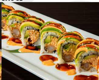
SEXY MEXI 7.45 IN: SPICY I-CRAB, AVOCADO SHRIMP TEMPURA OUT: AVOCADO, SPICY MAYO, EEL SAUCE, SRIRACHA