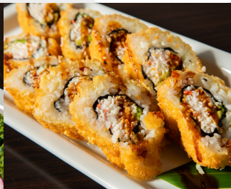
GOLDEN CALIFORNIA 5.95 IN: I-CRAB, AVOCADO OUT: EEL SAUCE