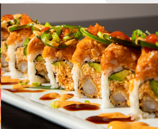
MONSTER 7.45 IN: SPICY I-CRAB, AVOCADO SHRIMP TEMPURA OUT: SPICY ALBACORE, JALAPEÑO SLICES, GARLIC PONZU, SPICY MAYO, EEL SAUCE, SRIRACHA