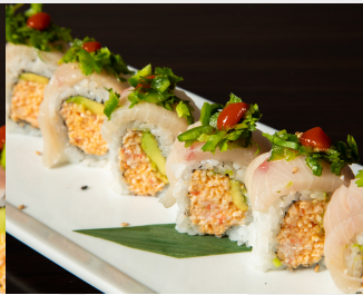
YELLOWTAIL SURPRISE 6.95 IN: SPICY I-CRAB, AVOCADO OUT: YELLOWTAIL, GARLIC PONZU, CILANTRO JALAPEÑO MIX, SRIRACHA