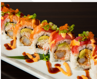
TROPICAL PUNCH 7.45 IN: I-CRAB, SHRIMP TEMPURA, AVOCADO OUT: TUNA, SALMON, GREEN ONION, MASAGO, PONZU, SPICY MAYO, EEL SAUCE