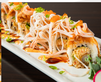
MONSTER INC 7.95 IN: SPICY I-CRAB, AVOCADO SHRIMP TEMPURA OUT: SPICY ALBACORE, KANI STICK, CRUNCH FLAKES, GREEN ONION, MASAGO, GARLIC PONZU, SPICY MAYO, EEL SAUCE