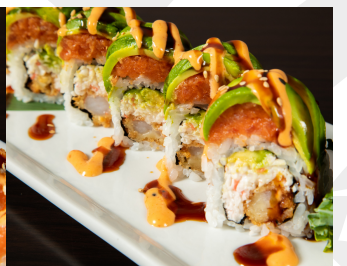
SEXY AVOCADO 7.45 IN: I-CRAB, SHRIMP TEMPURA, AVOCADO OUT: SPICY TUNA, AVOCADO, CRUNCH FLAKES SAUCE: SPICY MAYO, EEL SAUCE