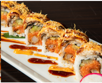
UNAGI XO 7.45 IN: SPICY TUNA, CUCUMBER, SHRIMP TEMPURA OUT: EEL, BONITO FLAKES, SPICY MAYO, EEL SAUCE