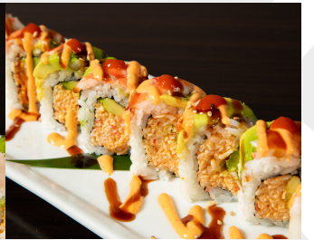
SPICY SHRIMP 6.95 IN: SPICY I-CRAB, AVOCADO OUT: SHRIMP, AVOCADO SAUCE: PONZU, SPICY MAYO, EEL SAUCE, SRIRACHA