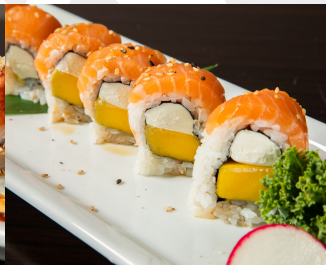
SALMON DELIGHT 6.95 IN: CREAM CHEESE, MANGO OUT: SALMON, MANGO SAUCE