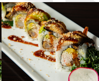
CRUNCH DRAGON 7.45 IN: I-CRAB, SHRIMP TEMPURA, AVOCADO OUT: EEL, AVOCADO, CRUNCH FLAKES, EEL SAUCE