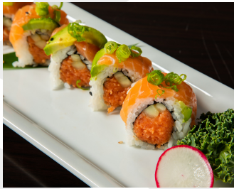
SUNKIST 6.95 IN: SPICY TUNA, CUCUMBER OUT: SALMON, AVOCADO, GREEN ONION, PONZU