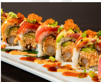
SUPER STAR 7.45 IN: SPICY I-CRAB, AVOCADO SHRIMP TEMPURA OUT: TUNA, AVOCADO, GREEN ONION, MASAGO, PONZU, SPICY MAYO, EEL SAUCE, SRIRACHA