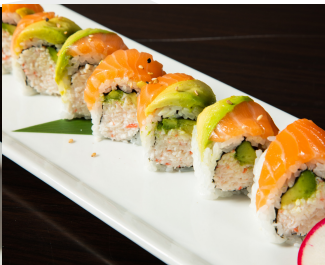
WASHINGTON 6.95 IN: I-CRAB, AVOCADO OUT: SALMON, AVOCADO, PONZU